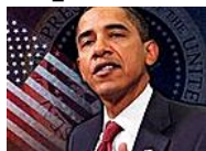
Obama to Lay Out Middle East Vision