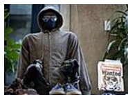
Unabomber's Manifesto, Clothing Up for Auction