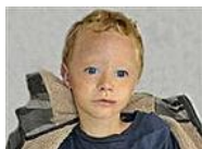
Woman Questioned in Find of Dead Boy on Road